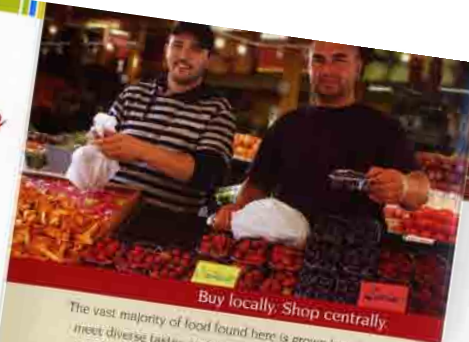
Buy locally. Shop centrally.

Farm fresh eggs. Premium cuts of meat and poultry. Homemade sausages and hand-cured bacon. That's the way things are still done at Crossroads Market. Here, you get your goods straight from the grower. It doesn't get any better. Or any fresher.